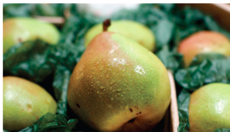
Royal Riviera pears in a Harry & David gift basket.

The holidays, their excesses, and the absolution of those excesses in the unblemished promise of the new year are nigh upon us. As such, I feel the need to come clean about something that seems especially timely: I am a fruitcake proselytizer. What's more, I have successfully converted a rather large number of previously fruitcake-despising people—and they are legion—to my faith.